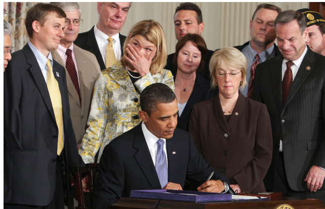
On May 5th, 2010, President Obama signed the Caregivers and Veterans' Omnibus Health Services Act into law while Senator Patty Murray looked on.

http://www.rules.house.gov/111/Com-mJurRpt/111_hr2647_rpt.pdf , pp. 315-316