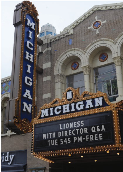
Michigan Theater, Ann Arbor, MI.

licensed domestic broadcast rights to the PBS series Independent Lens and the film was broadcast nationally in honor of Veterans' Day in November 2008. According to PBS, the November broadcast alone was viewed by 791,000 and received 215 media placements. These figures do not include additional viewership and media resulting from the encore broadcasts in June 2009 and December 2011.